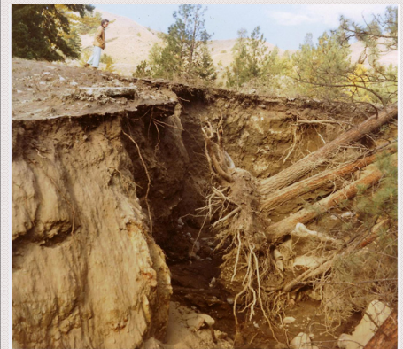
Supply Conduit major wash-out of 1973

As time continues to march on, BMID is very interested in collecting photos, stories from persons involved with the district, and information on relevant historical events that have occurred during the last 90 years.