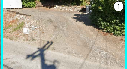
Cyan hatched area depicts TCPr location and escape route. Photo above depicts TCPr location and escape route