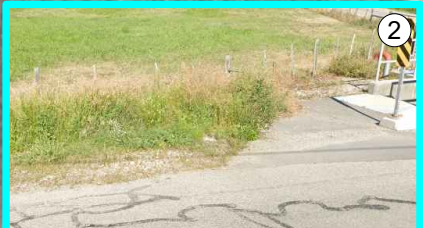
Cyan hatched area depicts TCPr location and escape route. Photo above depicts TCPr location and escape route